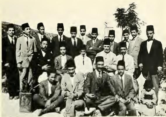
BAHAI STUDENTS ON MOUNT CARMEL